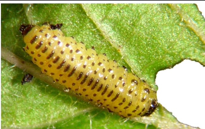
Viburnum leaf beetle larva

The beetle was first discovered in Massachusetts in 2004, in Berkshire County. Surveys have since detected its presence in Bristol, Franklin, and Middlesex County. This species has also been found Maine and New York, and more recently in Connecticut, New Hampshire, Vermont, Pennsylvania and Ohio.